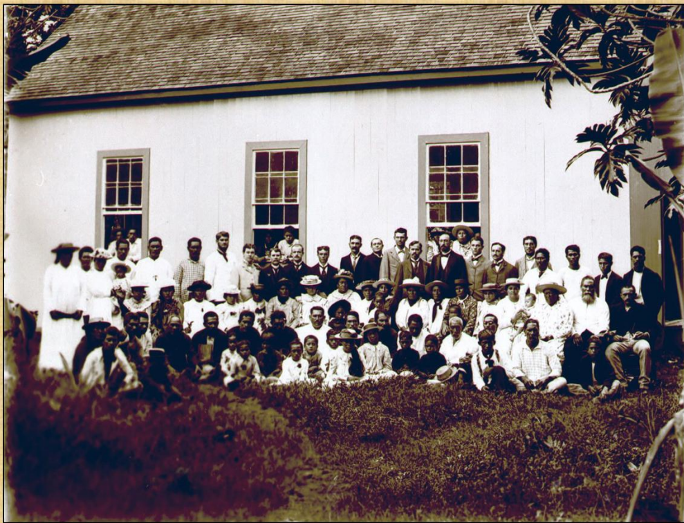
Tahitian Members Fautaua, Papeete 1898