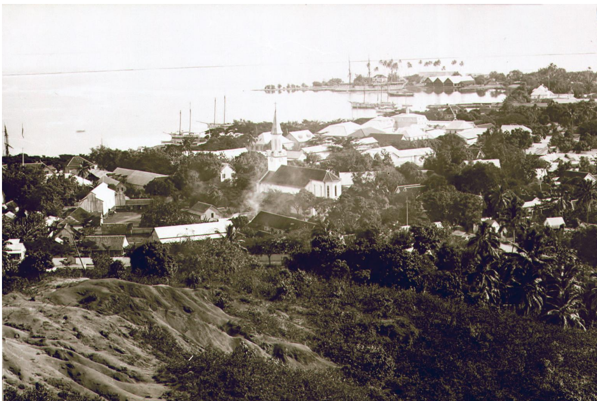
Papeete Harbor 1898 note Catholic Cathedral