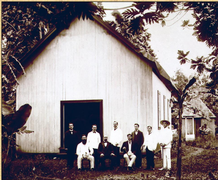
Tahitian Missionaries - December 14, 1898