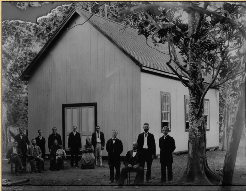
Papeete, Tahiti Chapel - 1898