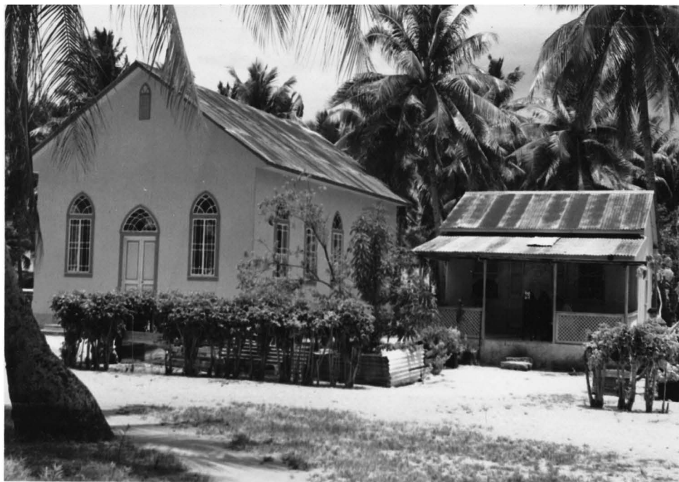
New Hikuero Chapel had been constructed by 1948 Note windows by door.