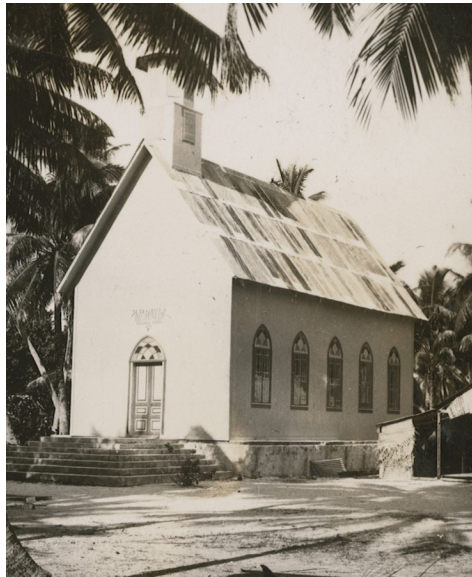
By 1932 when President George Burbidge visited the front canopy had been removed as well as the exterior walls had been modified.