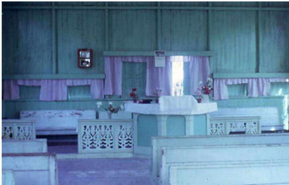
Interior of Hikueru Chapel 1964 - No Rameumpton as in Takaroa