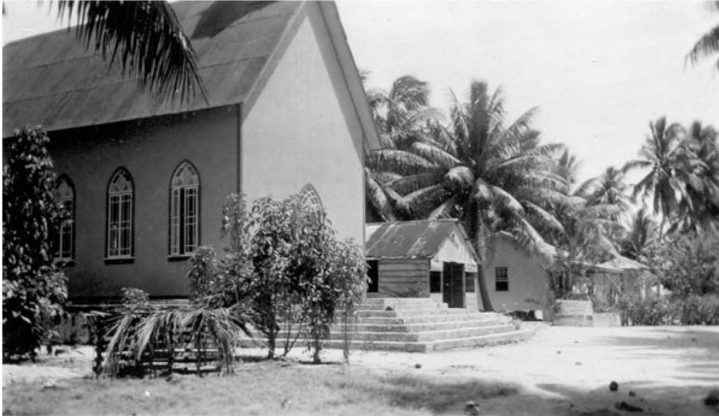
Hikuero church, fare putuputuraa, and the Missionaries' home. This home was shipped out from Tahiti, all measured out and ready to put together. The fellow that owns it is a Reorganite, but as soon as he built it he turned it over to the Missionaries. December 1938.