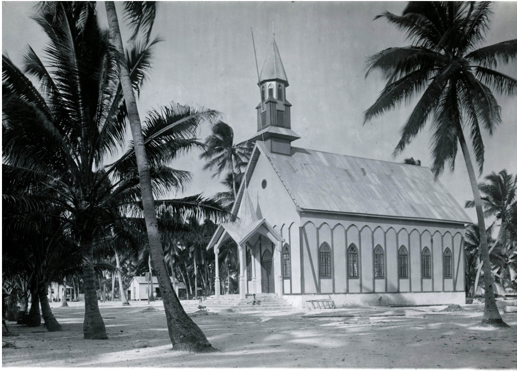
The Hikueru Chapel was dedicated November 8, 1918 by President Ernest C Rossiter.